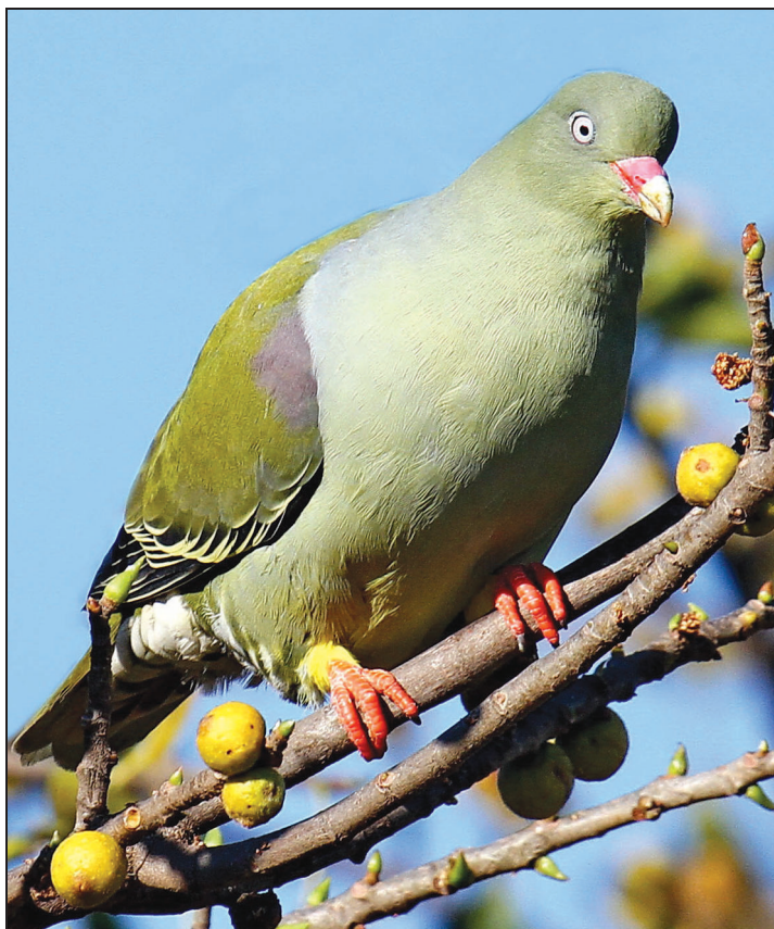
A Green Pigeon.

Paradise Flycatchers were back from their sojourn in the tropics, always lovely to see as they dance their way among the branches, disturbing tasty morsels as they fly. Golden-rumped and Red-fronted Tinker Barbets along with the much bigger White-eared Barbet were exciting.